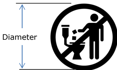
'Do Not Flush' symbol

Packaging for non-flushable products that have a potential to be flushed must clearly indicate that the product should not be disposed of via the toilet by displaying the 'Do Not Flush' (DNF) symbol. The additional use of the 'Dispose via the Solid Waste Stream' ('Tidy Man') symbol to confirm disposal via the solid waste system is discretionary; where used, it is recommended to be the same size as the DNF symbol.